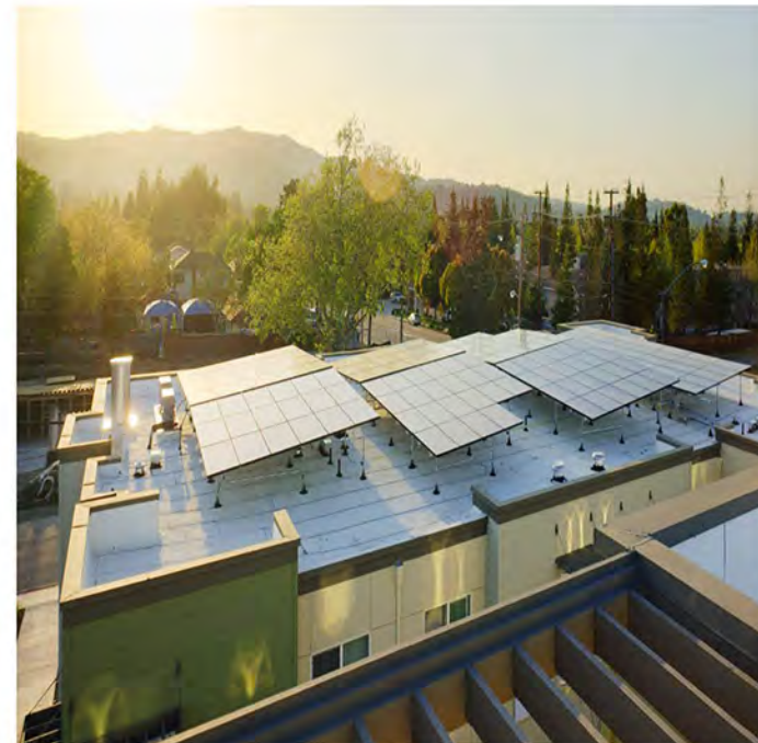
All-Electric w/ Renewable Energy Generation