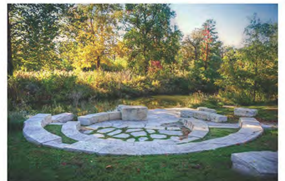
Walls at Labyrinth