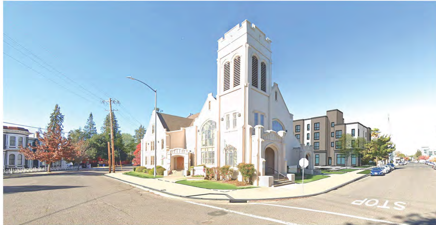
View 1: Intersection of Randolph St & Division St