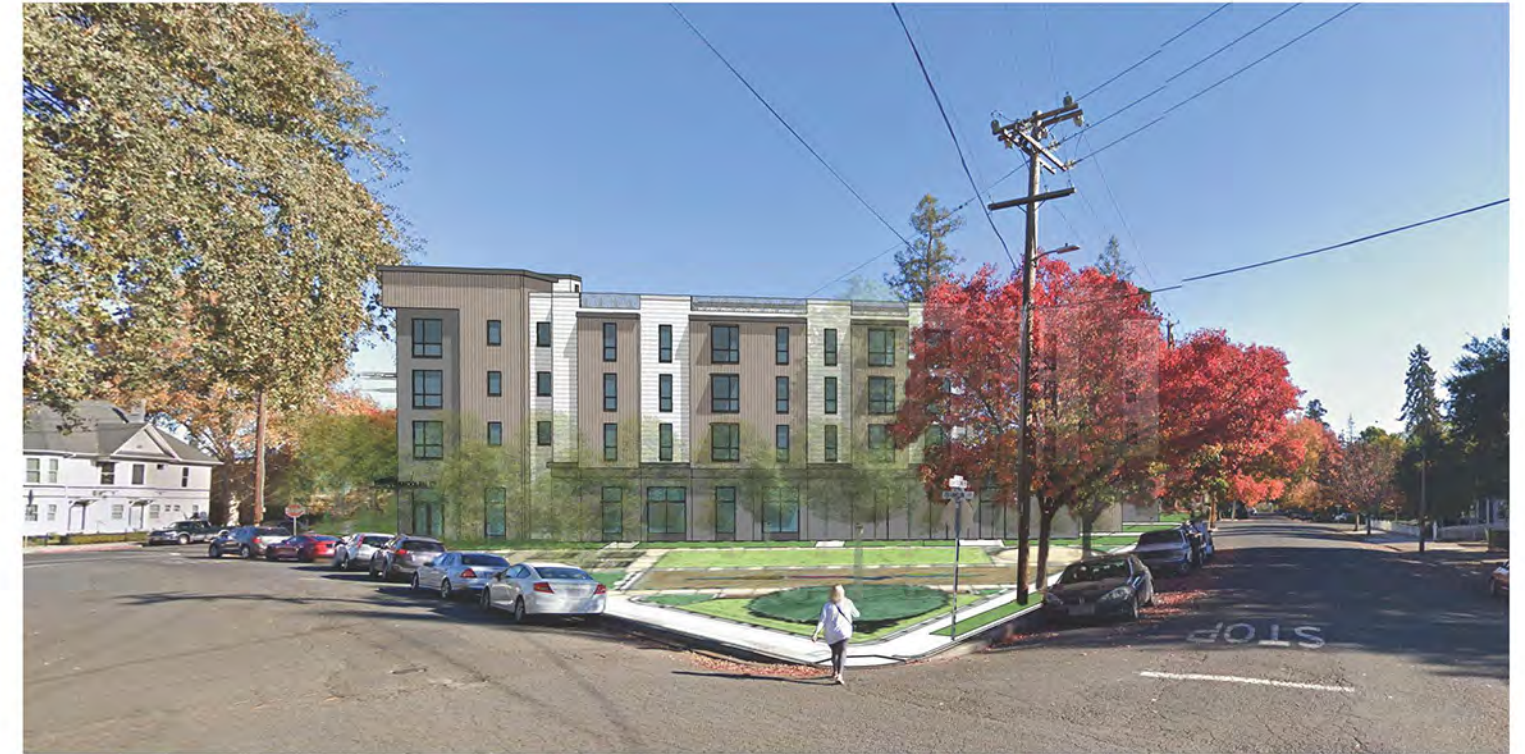
View 2: Intersection of Franklin St & Division St