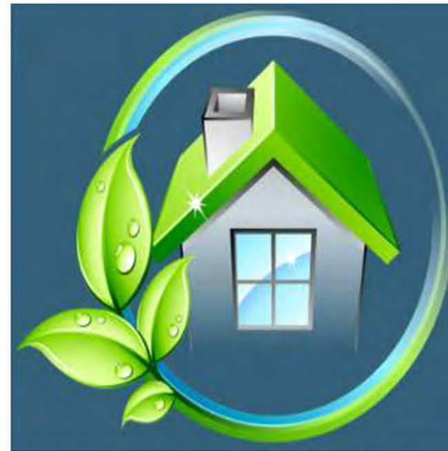
Natural Ventilation, Low/No VOC & Formaldehyde Free