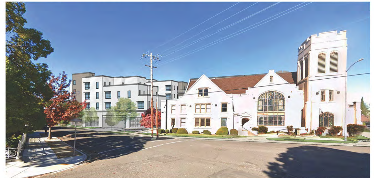
View 4: Along Division St