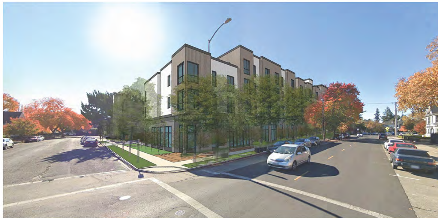
View 3: Intersection of Fourth St & Randolph St