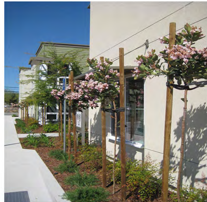
Drought Tolerant Landscape